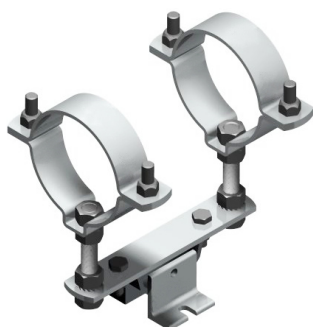
Type 116 L-GW